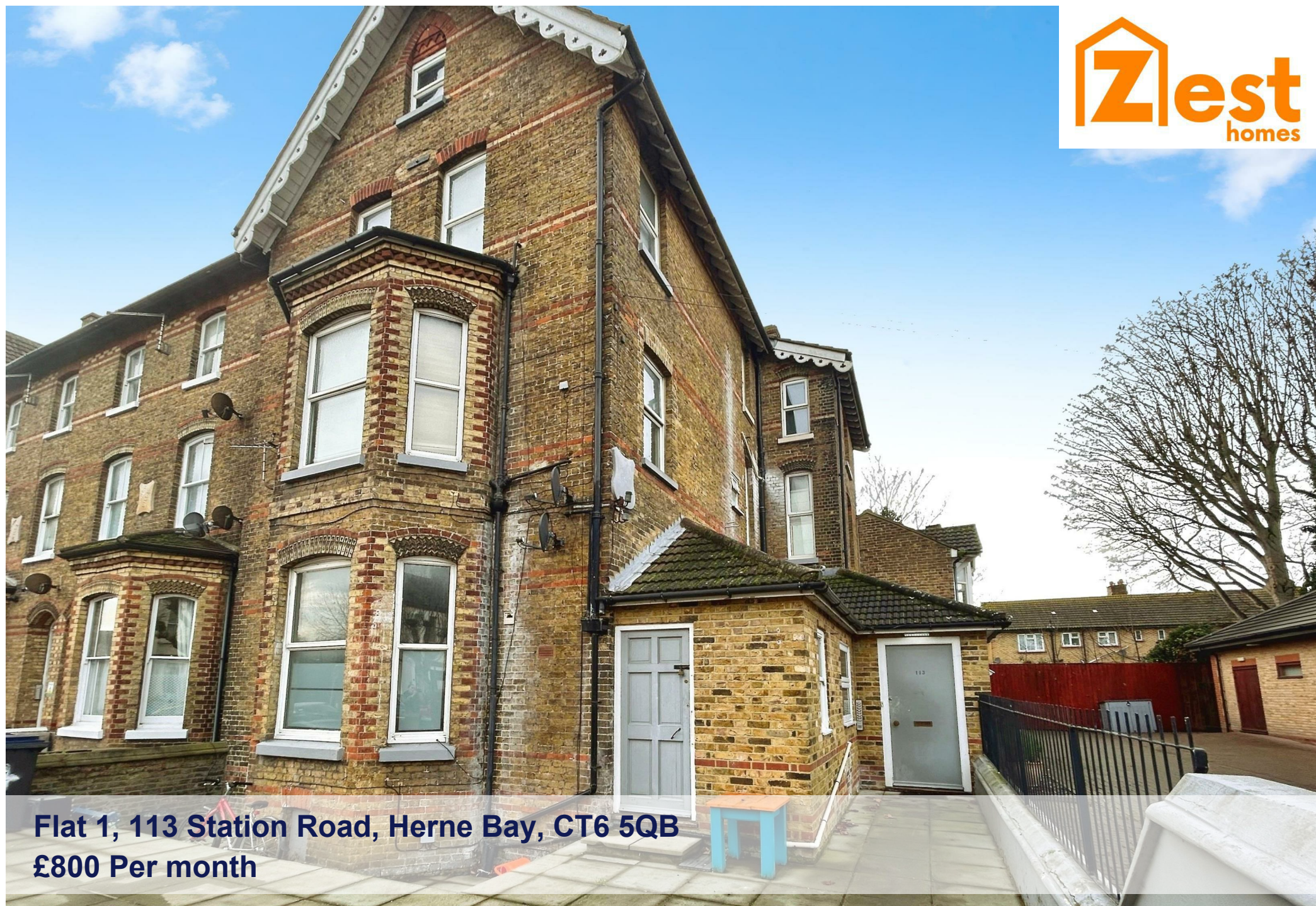
Flat 1, 113 Station Road, Herne Bay, CT6 5QB £800 Per month